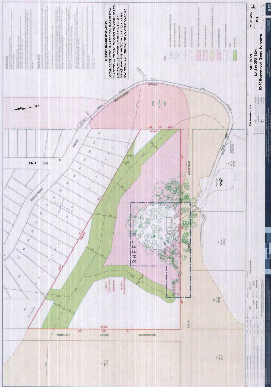
Figure 2. The current proposal in relation to the subject land and neighbouring landholdings.