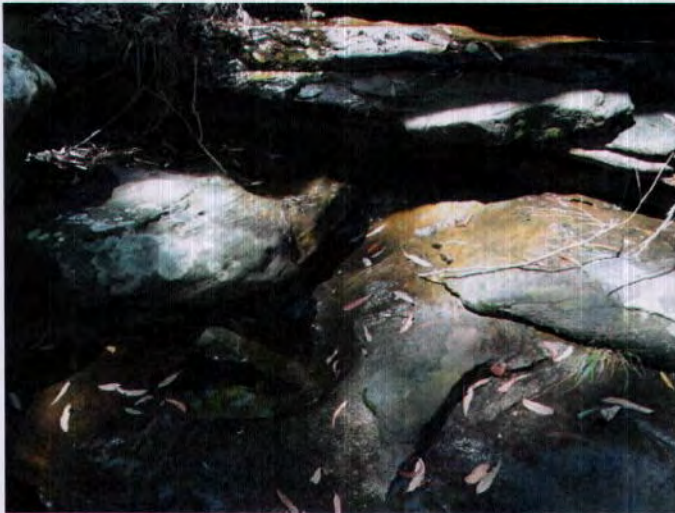
Figure 14. An example of the rocky creek bed.