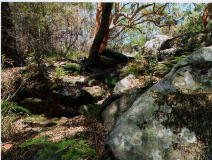
Figure 10. Example of the outcropping rock that was defined in three benches within the subject land.