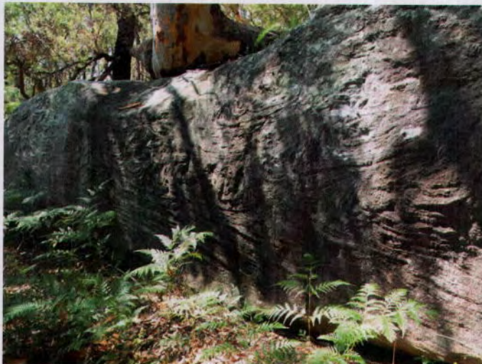
Figure 12. Natural ripple marks in one sandstone outcrop in the south-western portion of the subject land. View south-east.