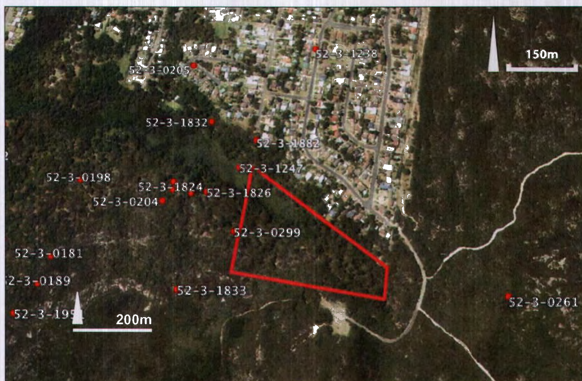
Figure 4. Locations of registered Aboriginal sites in the vicinity of the subject land.

The following are the registered sites within closest proximity to the subject land: