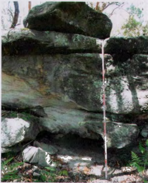
Figure 11. A typical example of the small overhangs present within the subject land that are too small to provide habitation.