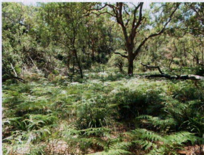
Figure 15. View north across the gully toward the houses on Beachcomber Avenue.