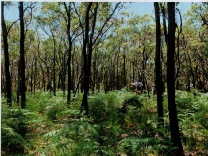
Figure 7. View northwest over area where the caretaker's accommodation and access driveway is proposed.