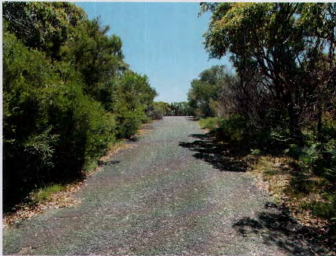
Figure 5. The vehicle track maintained by National Parks that is proposed to be the access track for the current proposal View south-east.