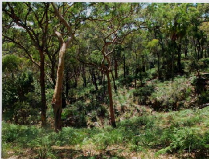
Figure 13. The 'spurs' created by the incised creek lines. View east toward the western creek.