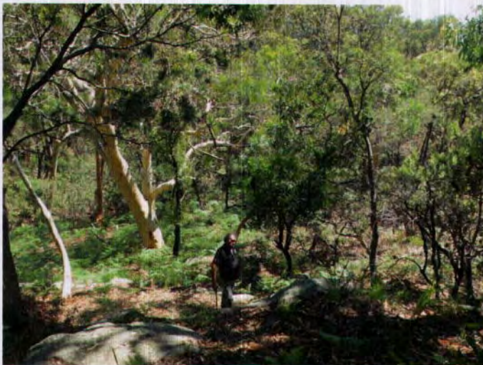
Figure 9. Example of the vegetation on the steeper slope below the proposed development area western side. Note the mature angophora. View north-west.