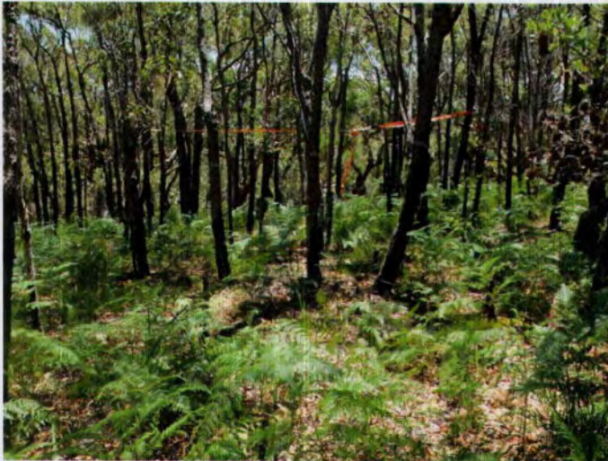
Figure 8. Example of vegetation on the gently sloping area where the development is proposed. Also location of proposed guest hut No.3. View north.