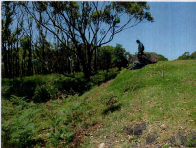
Figure 6. Built-up area from former use as Council night soil depot in the area where the current access track is proposed to be extended into the subject land. View East.